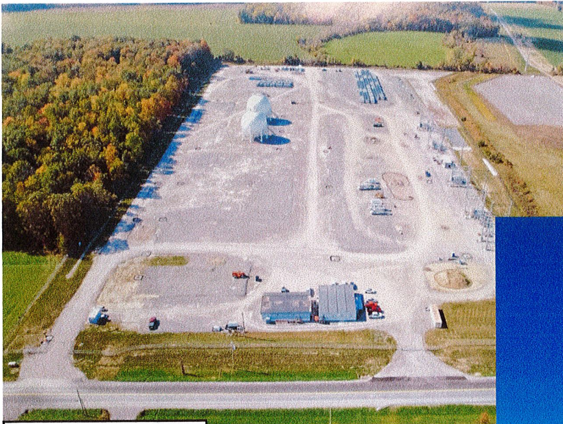
Figure 1: Site Photo

Work will include demolition of the tanks and supporting columns, removal of all associated spread footings and pedestals, demolition and removal of existing utilities serving or associated with the tanks, and backfilling of all resulting voids with suitable fill material. Voids created from foundation removal will be backfilled with crusher run material sourced from a nearby quarry.